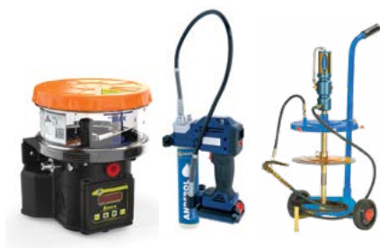
Centraline di lubrificazione per oli e grassi.