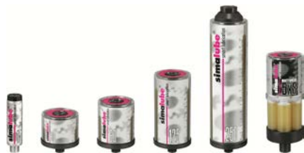
Lubrificatori automatici di vario tipo.