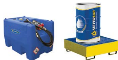
Attrezzature di travaso e stoccaggio di oli e grassi.